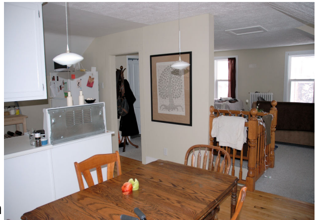
Accessory Apartment Kitchen